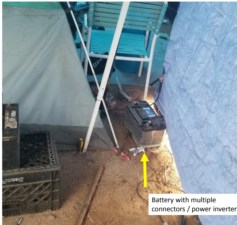
Battery with multiple connectors / power inverter