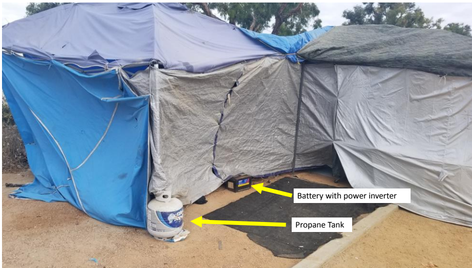
Battery with power inverter